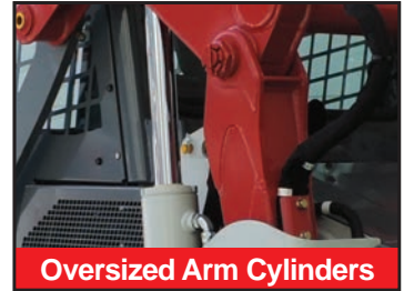
Oversized Arm Cylinders

The TL10V-2 vertical arm track delivers excellent functionality, performance, comfort, and serviceability. It features a completely redesigned operator's station with a 5.7" color multi-information display and updated rocker switches that control a wide range of machine functions.