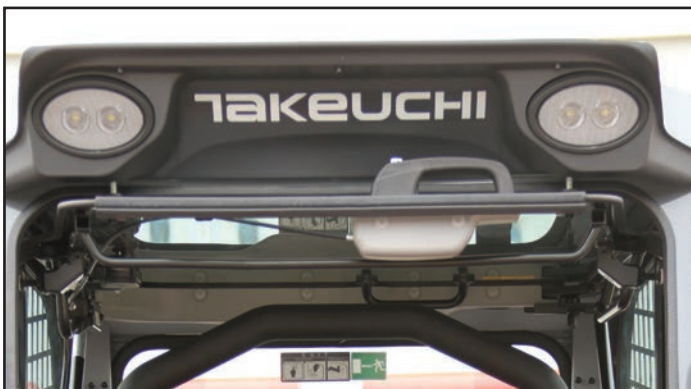
Roll Up Door