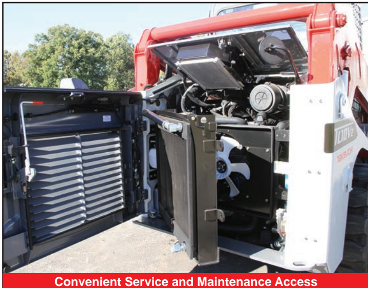
Convenient Service and Maintenance Access