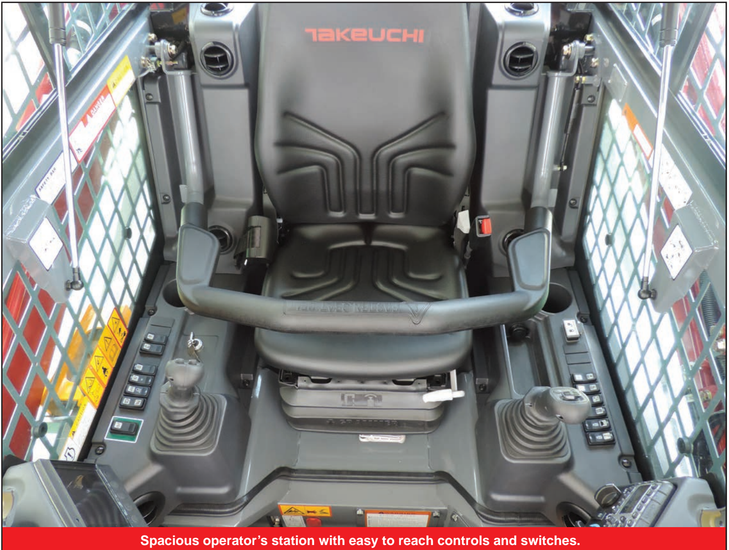
Spacious operator's station with easy to reach controls and switches.

An updated undercarriage with a wide block quiet ride track system provides better flotation, improved ride quality, and a reduction in noise and vibration. A powerful 54.6 kW engine meets the latest EU Stage V / EPA Tier 4 emissions standards while delivering an outstanding blend of power and torque for impressive performance in the most demanding applications.