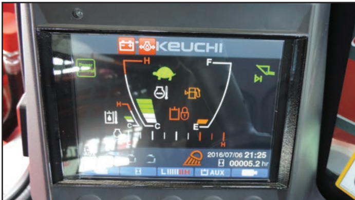
5.7" Color Display