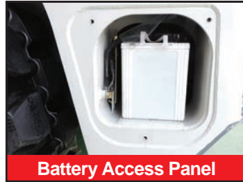
Battery Access Panel