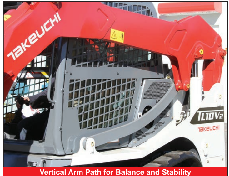
Vertical Arm Path for Balance and Stability

*Functions may not be available in all countries, so please consult your Takeuchi dealer for details.