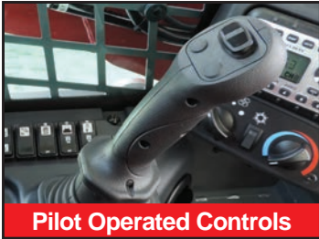
Pilot Operated Controls