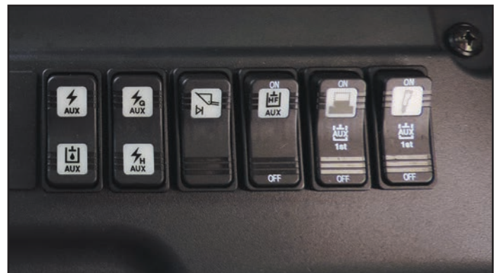
Multi-Function Switch Bank