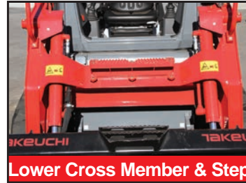
Lower Cross Member & Step