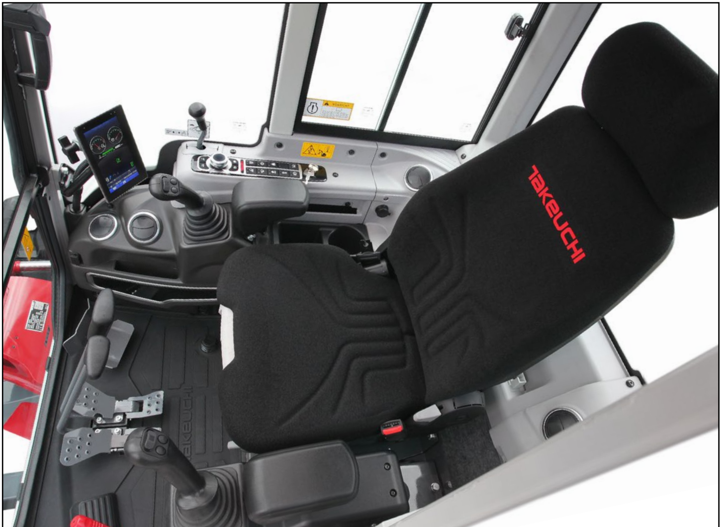
Completely Redesigned Automotive Styled Interior with Intuitive Operator Controls

Takeuchi's TB350R, TB300 Series, compact excavator features the latest technology and a short tail swing design that makes it ideal for working in tight or confined spaces. Inside the cab, a seven-inch, multifunction color monitor with touch screen places a wide range of functions at the operator's fingertips. A dedicated coupler circuit allows for the quick and easy exchange of various hydraulically driven attachments when used with an optional hydraulic coupler. A jog dial with one-touch controls lets operators easily control throttle position and multiple machine functions. The TB350R also offers a dig depth of 3,575 mm, maximum reach of 6,065 mm and maximum dump height of 3,945 mm. Combine those working ranges with its high-flow primary auxiliary circuit, and the TB350R is ideal for multiple applications, including demolition, land/vegetation management, general contracting, landscaping, hardscaping, rental, residential, and commercial construction.