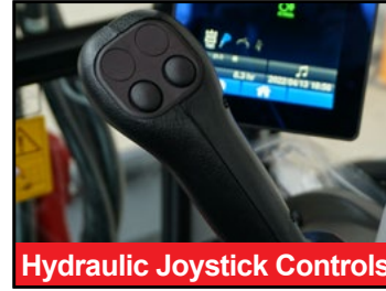
Hydraulic Joystick Controls