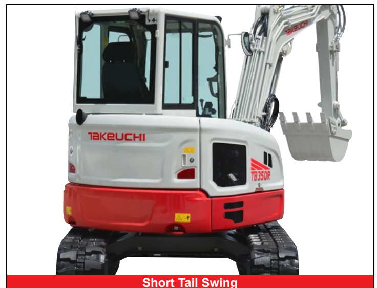
Short Tail Swing

*Functions may not be available in all countries, so please consult your Takeuchi dealer for details.